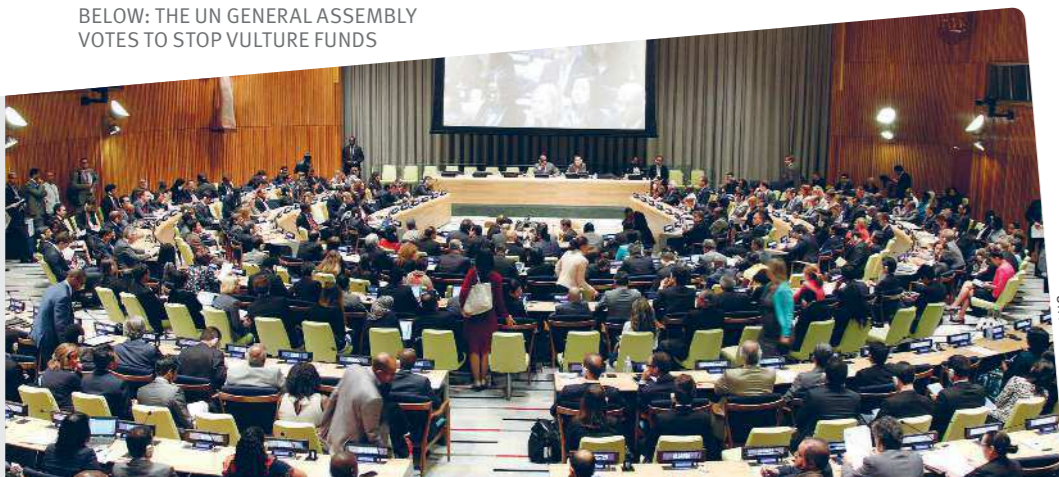
BELOW: THE UN GENERAL ASSEMBLY VOTES TO STOP VULTURE FUNDS

unless it also paid the vulture funds in full. When the US Supreme Court turned down the final appeal in June, the country was forced into a new debt default. Argentina's decision to refuse to give in to 'extortion' has attracted support from around the world, including from over 100 British MPs who signed Early Day Motion 666, following campaigning by Jubilee Debt Campaign supporters earlier this year.